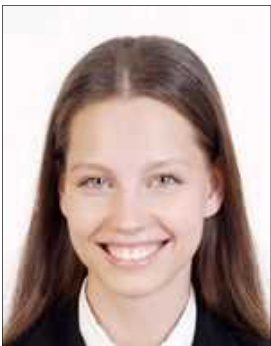
Mouth opens Looks different from normal face expression