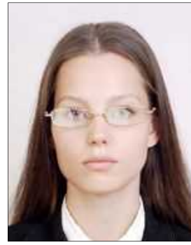
Reflection on lens