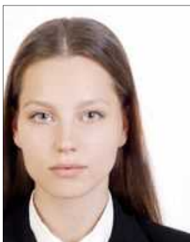
Image is not centered

■ Not meeting the requirement sizes and the standards