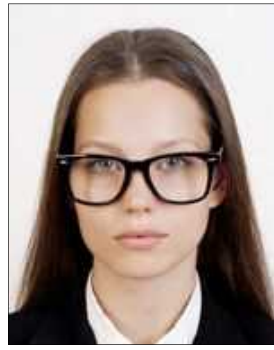
Too thick frames