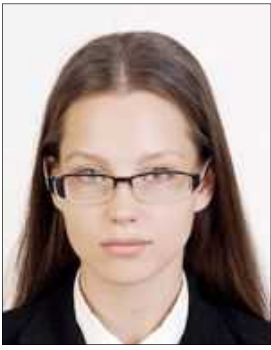
The frames across eyes