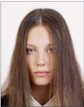
Hair covering eyes