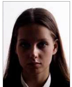
The part of the face is in shade