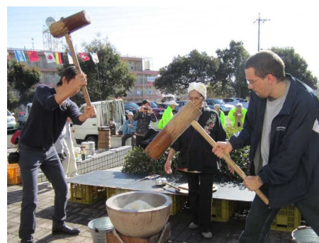
Traditional Culture Experience