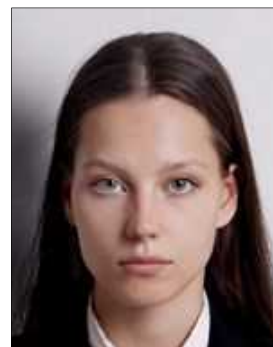
There's a shadow behind her head Not body front