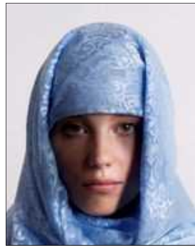
The part of the face is in shade because of head covering. (if there's no shadows and show the full face, head covering is allowed)