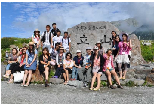
International Students Summer Trip

Monthly payment is to be made by an automatic money transfer from the bank account opened by the resident (*the bank designated by Gifu University: Kurono Branch of Juroku Bank).