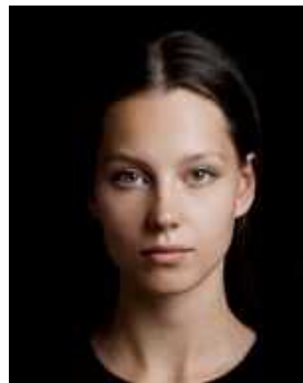
Vaguely-outlined image because of too dark behind