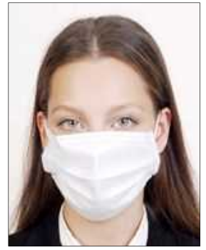
Hide one's face by a mask